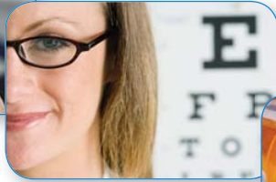
Vision (including Lasik)